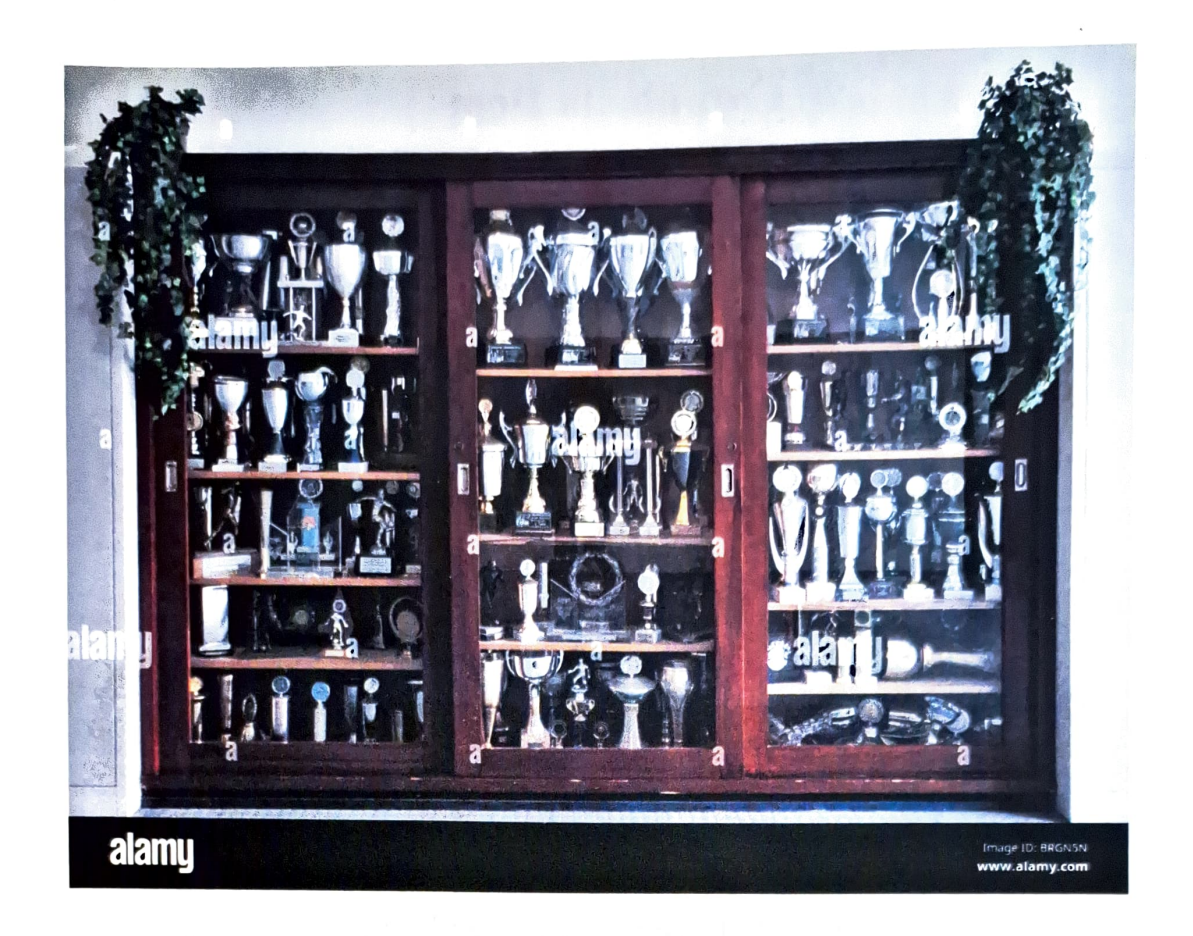
Size (Hight-7 Ft Length-5ft Depth -1.5)

Material for the Trophy rack :- plywood or wood base particle board (Trophy rack made in plywood will be preferred)