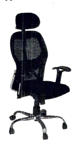
Revolving Office Chair