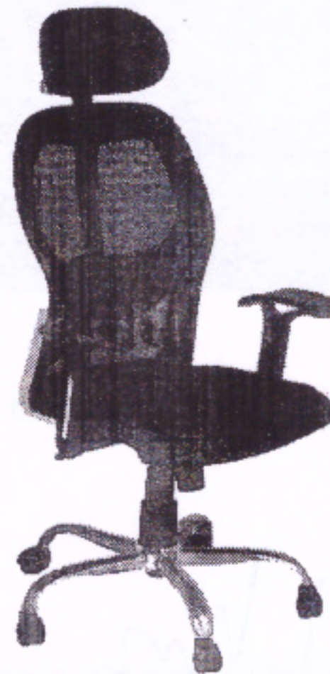
Revolving Office Chair